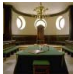
An example of a courtroom that includes a chief magistrate’s bench similar to one that would have been found in the Brentsville Courthouse.